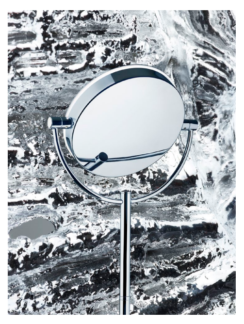
Merinat, a parallel exhibition by Thomas Adank provided by the RATS

In parallel with its own productions, Festival Images also welcomes projects by the people and institutions that ensure Vevey's status as a 'city of images' all year round: museums, galleries, workshops, cinemas, shopkeepers and artistic collectives. Indeed, Festival Images represents an opportunity to gather and provide visibility to a whole range of initiatives in the field of visual arts. These projects are part of the programme, even if they are categorised under the label 'parallel exhibitions and side events'. The curating, form and content of each project is entirely drawn up by the project initiators. These collaborations are invaluable for the dialogues and exchanges they promote. They demonstrate the dynamism of visual arts in the region and contribute to turn the city of Vevey into a giant museum for three weeks.