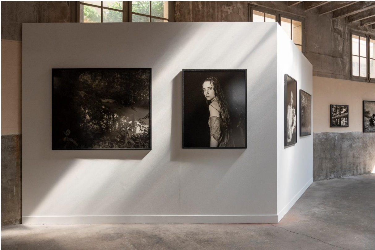
Exhibition Dark Waters by Kristine Potter at the Festival Images Vevey 2020 Laureate of the Grand Prix Images Vevey 2019/2020

IMAGES VEVEY BOOK AWARD is a grant worth 10 000 CHF (approx. 9250 EUR) that supports the creation of a book project which showcases an optimal and original balance between publication format and photographic content. It provides a financial contribution that aims to encourage artists to take risks and to innovate, in order for them to develop a suitable sophisticated publication format for their photography project.