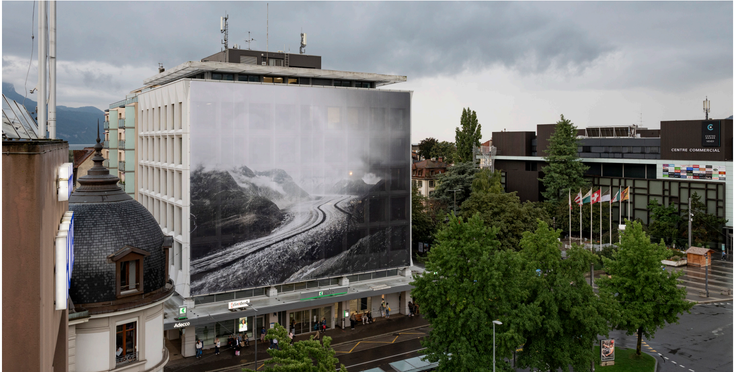
Vue d'installation Aletsch Glacier , Andreas Gursky, sur la Place de la Gare