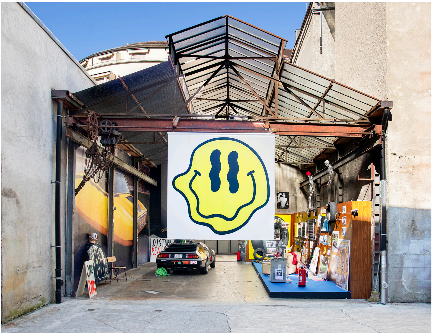
Vue d'installation Made on Earth by Humans , Beni Bischof, dans La Serrurerie

Some of the exhibitions will continue beyond the Biennial, such as the four installations at L'Appartement - Espace Images Vevey, on view until Sunday 3 November 2024, and Henry Leutwyler's exhibition at the Musée suisse de l'appareil photographique, which will run until 19 January 2025. Several outdoor installations, including those on the façade of the Hôtel Les Trois Couronnes, will remain on view until the next edition in September 2026.