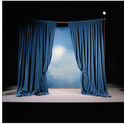
Kata Geibl, from the series Something Old, Something New, Something Borrowed, Something Blue