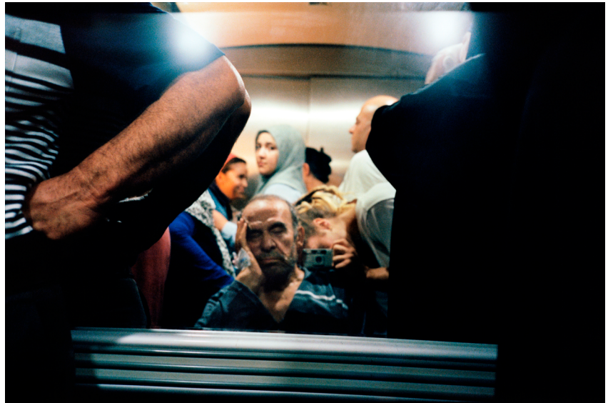
Untitled, 2014–2024, from the first chapter of Abdulhamid Kircher's project Rotting from Within