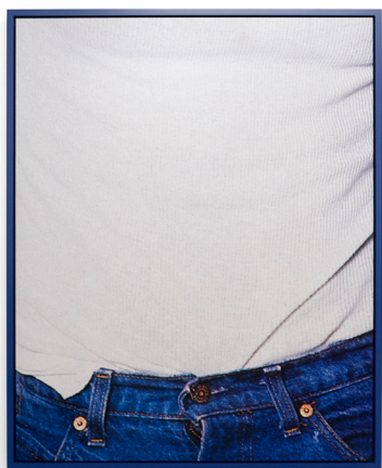
Faded Glory, Undercover Pleasures, 2022, Pacifico Silano